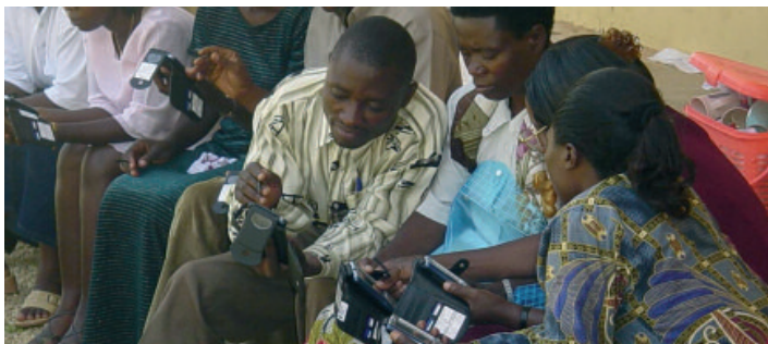
PERSONAL DIGITAL ASSISTANTS (PDAS) ARE PROVING TO BE A POWERFUL TOOL FOR DOCTORS AND HEALTH CARE WORKERS IN UGANDA.

Canada's International Development Research Centre (IDRC) was one of the first development agencies to embrace the potential of information and communication technologies (ICTs) for developing countries. IDRC partners are using innovative, low-cost ICT solutions to improve health, education, and business development.