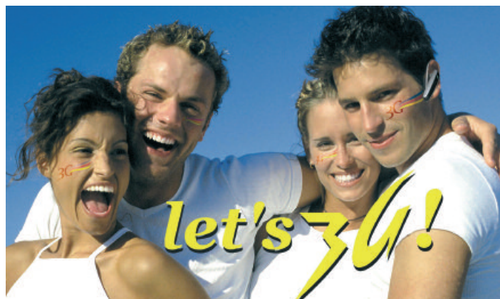
ZTE, BRINGING THE BENEFITS OF MODERN TECHNOLOGY TO ALL

This experience has helped us to bring modern fixed and mobile telecommunications to many developing regions which might otherwise not have been able to do this, or which might have